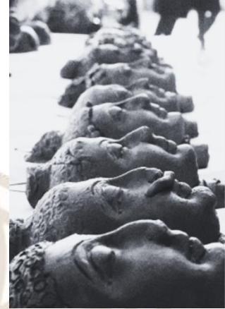
Wisdom Etched in Clay