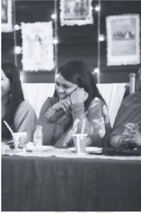
Proud Heart, Teary Eyes