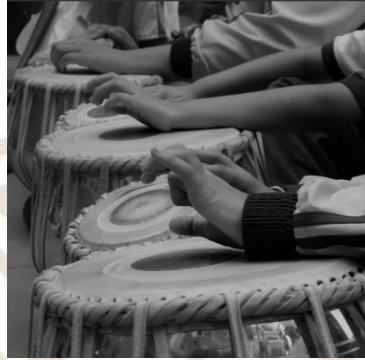
Rhythm in Sync