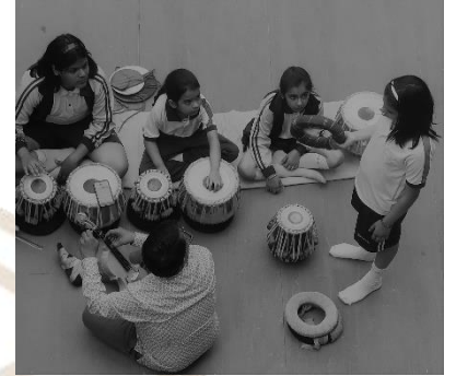
Learning the Beats