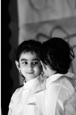
A Glance at a Friend